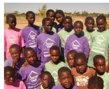
A few Girl Guides on their August 2010 campout!

Thank you for how you generously touch these girls' lives!