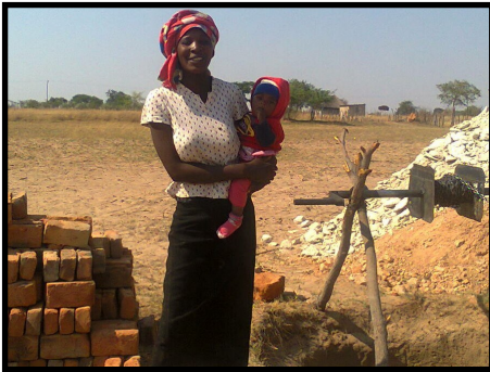
NEW WELL RECIPIENTS!

We are addressing health through the pre-school program, the extra-curricular program, and by building wells, but we have had to reduce what we can offer the local community at large. Because we are still in a position to offer a small amount of first aid assistance, we are asking for general support, and are hopeful about offering health education and services in the future! Thank you for whatever you can do!