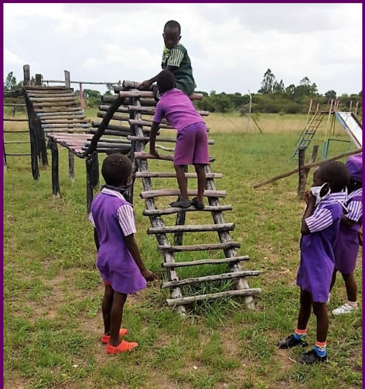
Preschoolers are playing on the jungle gym that has been sprayed with bleach obtained from the Chibikira school. These are the same protocols we are seeing here in the US.