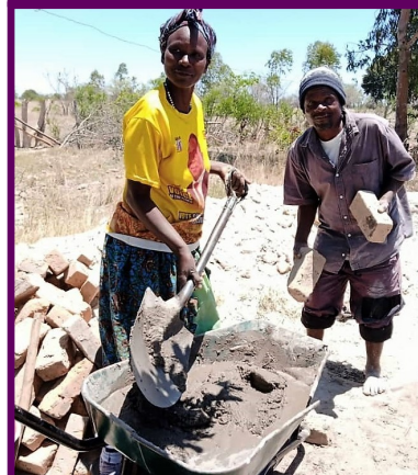
Well building couple team!