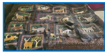
A sampling of the lovely blocks lost somewhere on the east coast...alas...

We had a few losses this year: 1) a box of library books stuffed also with special staff T-shirts hasn't shown up, and it's been 3 months, having left our soil in October. (It might arrive yet, one never knows.) 2) $500 worth of embroidery blocks from the women's sew-